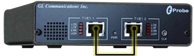
RJ48c Loopback Cable