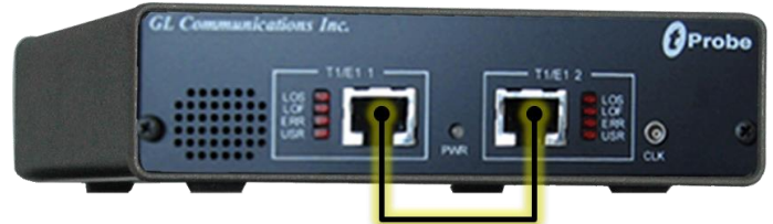
RJ48c Loopback Cable