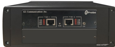
mTOP™ Probe with T1 E1 Unit