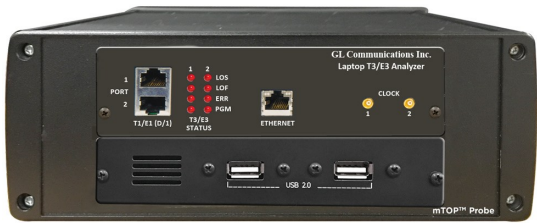
Figure: mTOP™ T3 E3 Probe (Front Panel)