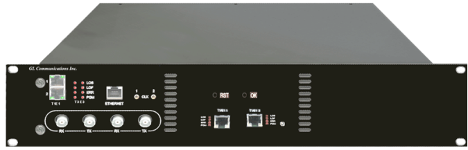
Figure: mTOP™ Rackmount T3 T1 E3 E1