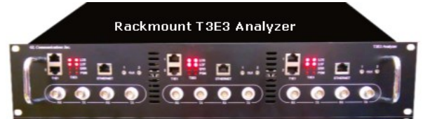
2U mTOP™ with 6x T3 E3 USB units