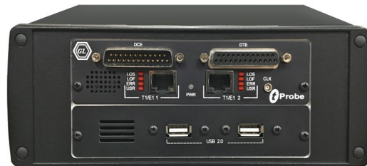
Figure: mTOP™ T1 E1 Datacom Probe Tester (Front Panel)