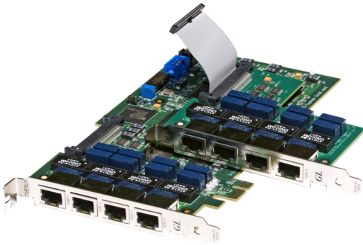
PCIe Based Octal and Quad T1 E1 Boards