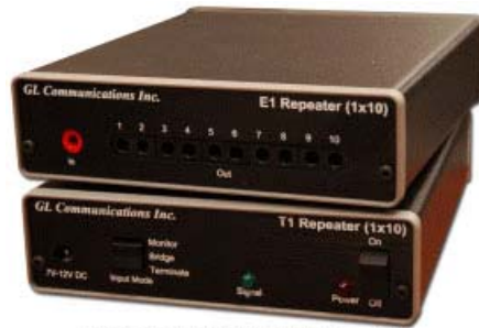
Single Multiport Repeater (Bantam Version)