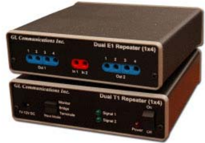
Dual Multiport Repeater (Bantam Version)