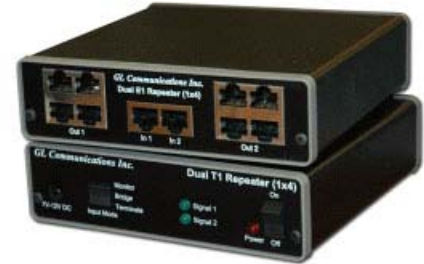
Dual Multiport Repeater (RJ45 Version)