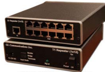
Single Multiport Repeater (RJ45 Version)