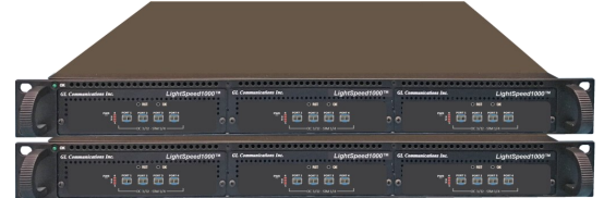
Stacked 1U mTOP™ with 6x LightSpeed1000™ Units