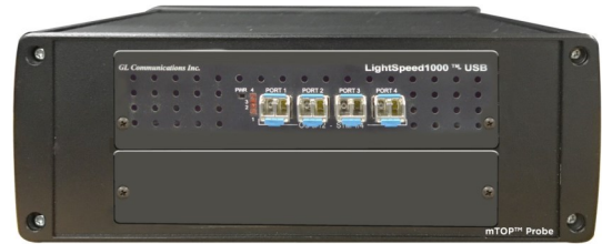
Figure: mTOP™ Probe LightSpeed1000™ (Front Panel)