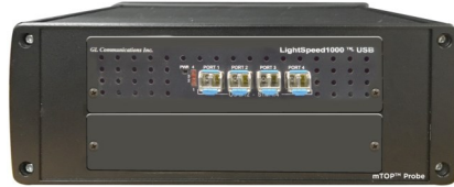
mTOP™ Probe with LightSpeed1000™