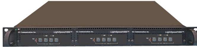
1U mTOP™ with 3x LightSpeed1000™ Units