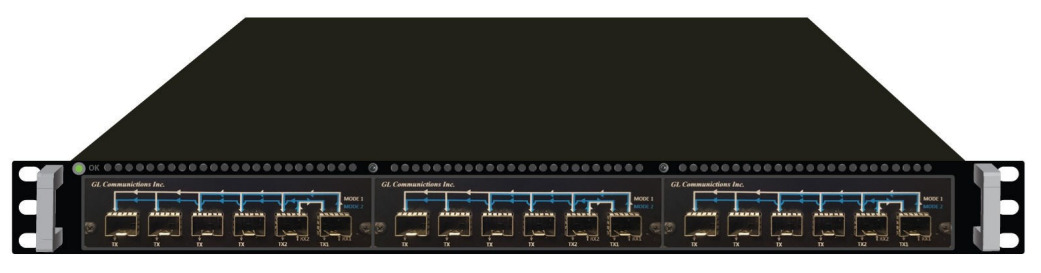
1U mTOP™ Multiport Optical Tap Repeater (100 Mbps to 2.5Gbps) (Front Panel View)