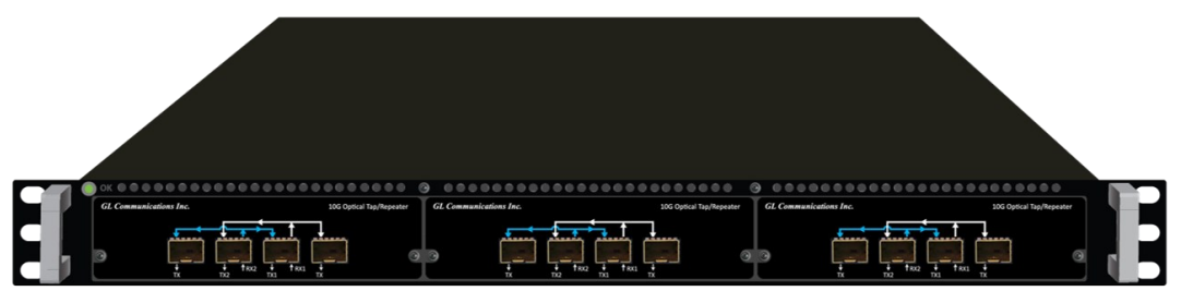
1U mTOP™ Multiport Optical Tap Repeater (Up to 10 Gbps) (Front Panel View)